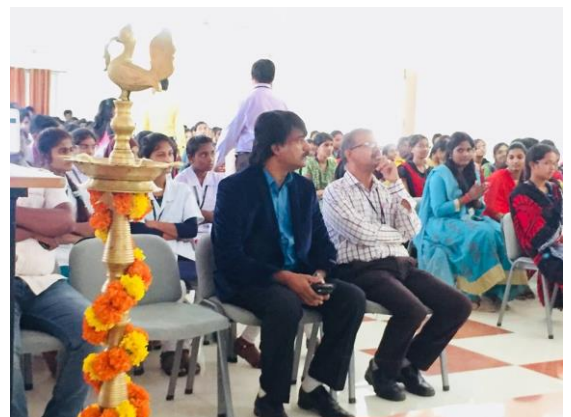
Director sir in world mental health day celebrations