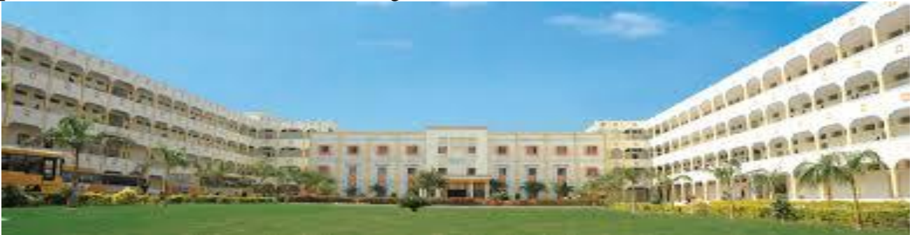
SREE DATTHA INSTITUTE OF ENGINEERING AND SCIENCE SHERIGUDA, IBRAHIMPATNAM, HYD

Dept Mission 4: Collaborate to meet the challenges and betterment of the mankind.